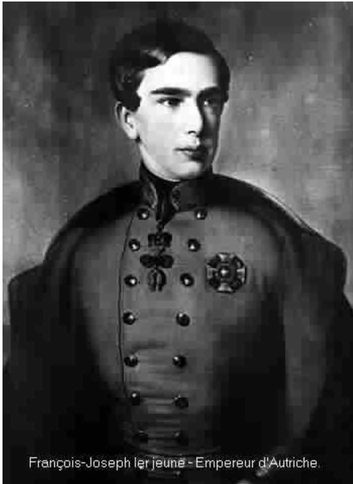
François-Joseph Ier jeune - Empereur d'Autriche.